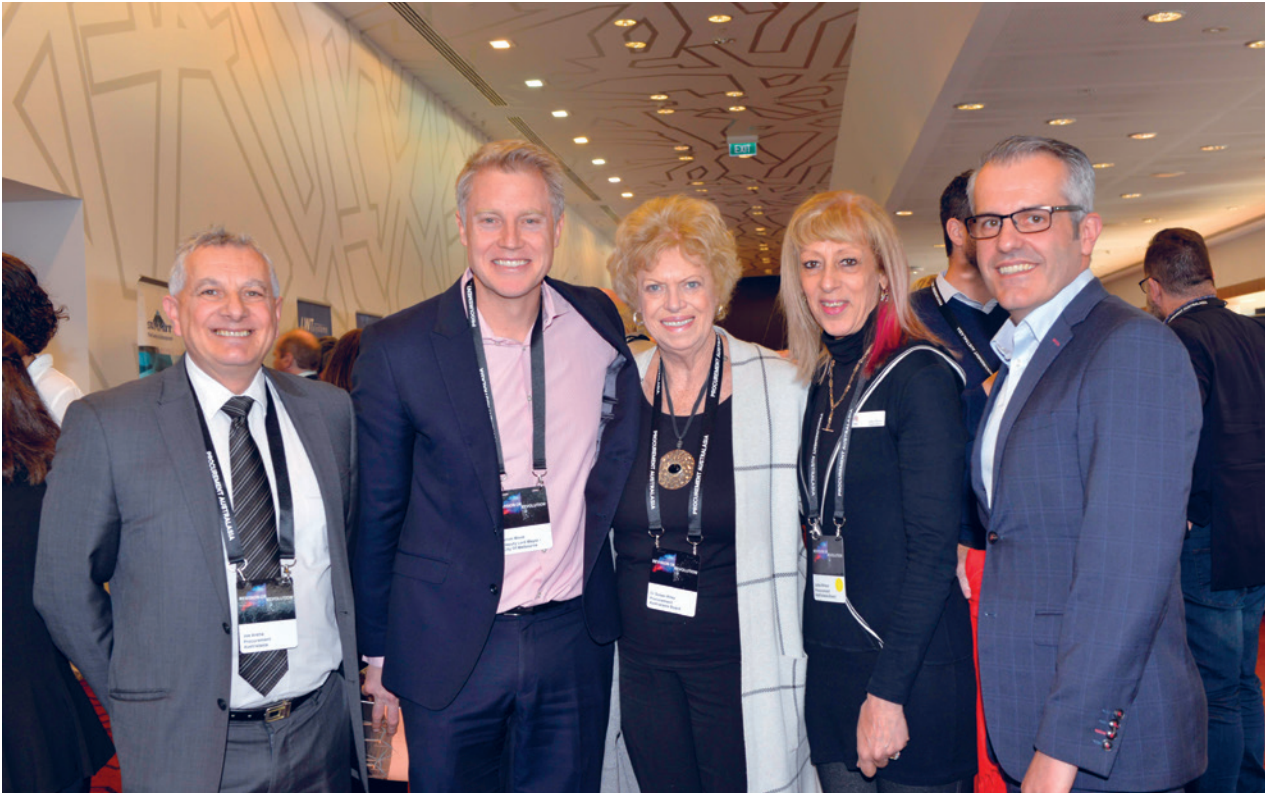
13th Annual Procurement Australia Conference.