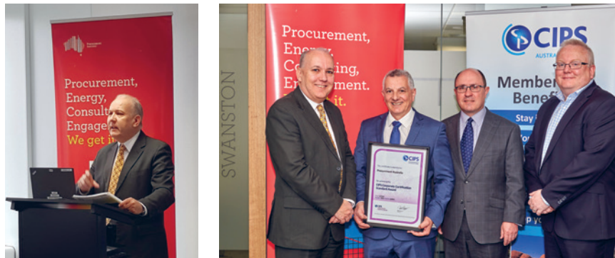
CIPS Certificate presentation ceremony.

‘Our business and its processes are now formally recognised by accreditation to two independent global standards – CIPS and ISO 9001-2015 – an achievement the whole company should be proud of.’