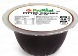
Pitted Prunes in Juice 100g x24 171542