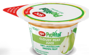
Portion Control Cloudy Pear 105mL x24 206544