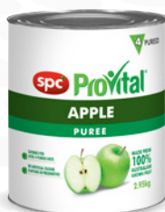
Apple 2.95kg x3 18333