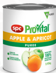
Apple & Apricot 2.95kg x3 66628