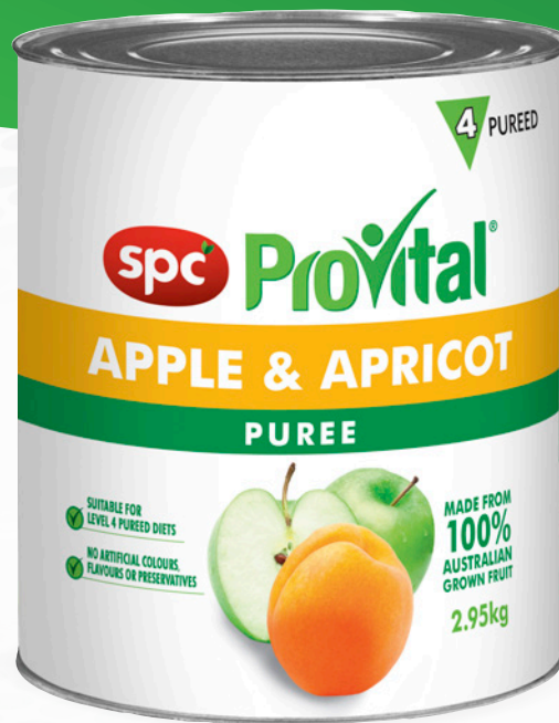
SPC ProVital Apple & Apricot Puree A10 can 66628