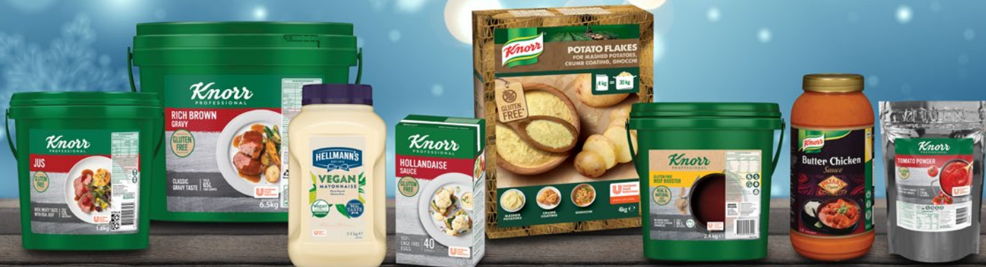
Knorr Hollandaise Sauce Knorr Boosters