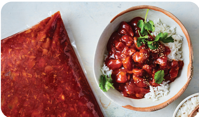
Honey Soy Chicken. Serves 13 per bag