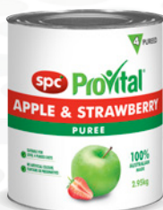
Apple & Strawberry 2.95kg x3 34052