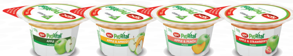
Apple 120g x24 160058