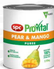
Pear & Mango 2.95kg x3 115143