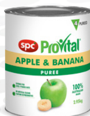
Apple & Banana 2.95kg x3 66629