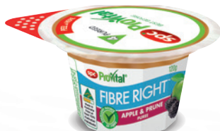
Apple & Prune 120g x24 166456