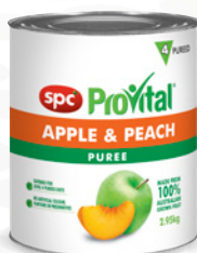
Apple & Peach 2.95kg x3 66627