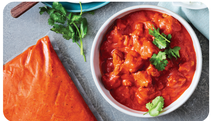
Butter Chicken. Serves 13 per bag

The Good Meal Co is part of SPC Care, the newly formed HealthCare division of SPC. Please contact your local Bidfood branch to place an order. goodmealco.com.au | spccare.com.au