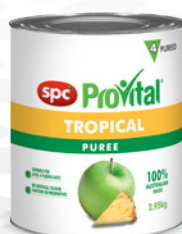
Tropical 2.95kg x3 66633