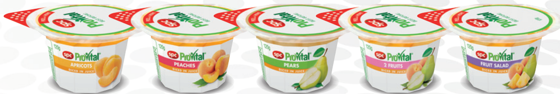
Apricots 120g x24 166455