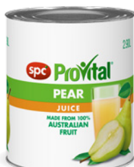
Pear Juice 2.9L x3 169848